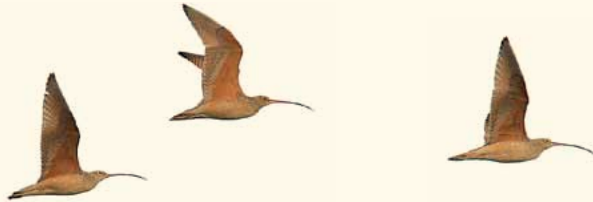
Long-billed Curlews. Tom Grey