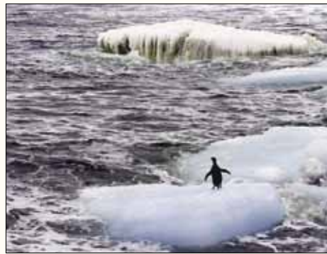
Adélie Penguin on an ice floe.

Assessing marine reserves. PRBO seabird monitoring is in demand to help assess the effectiveness of a new state network of marine protected areas (MPA) off California's coast. Using protocols from our long-term study of the Vandenberg State Marine Reserve, we have initiated baseline monitoring programs at five newly established MPAs from Shell Beach in central California to Bodega Bay in the north. Focusing on the use of nearshore habitats by breeding and nonbreeding seabirds, and on human disturbance, we will help managers determine if existing MPAs adequately protect these populations and, if not, where additional protection can be provided.