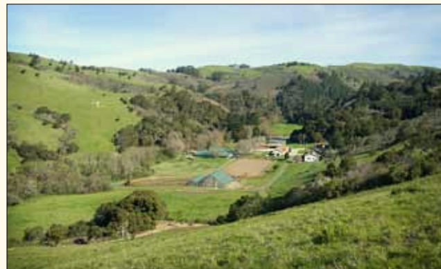
TomKat Ranch, site of PRBO's new field station (see page 4).