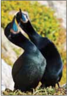
Brandt's Cormorants.

In our cooperative work to survey the California Current ecosystem, PRBO's data analysis and interpretation translates scientific information for management, supporting decisions that protect the sanctuary and ocean wildlife.