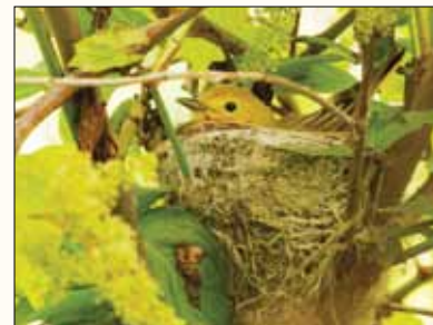
Yellow Warbler in riparian habitat.