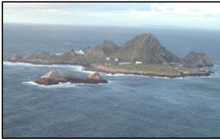
Southeast Farallon Island

PRBO transforms its bird and ecosystem science into conservation solutions for a healthier future. PRBO is dedicated to reducing the negative impacts of climate change, land use changes and changes in the ocean on birds and ecosystems. The following are samples of PRBO projects;