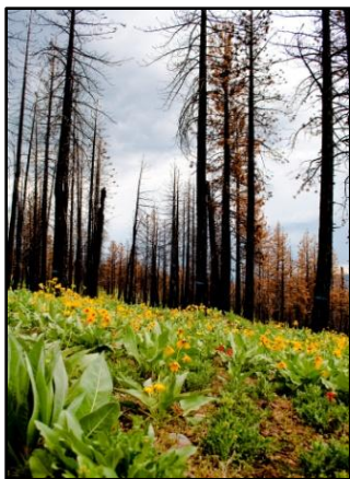
Plumas National Forest

SAN FRANCISCO BAY. PRBO is assessing the effects of sea-level rise and salinity on the San Francisco Bay tidal wetlands. In particular we are analyzing the effects on tidal marsh and other wetland bird populations.