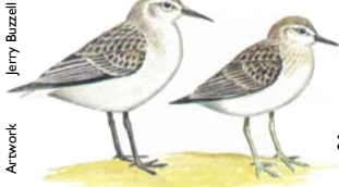
Western Sandpiper (left) & Least Sandpiper (right)

Migrating between northern breeding grounds and southern wintering homes, millions of birds follow the Pacific Flyway - one of four flyways that span the Americas. Like truck stops to truckers on a long highway, beaches and dunes are places where weary and hungry migrating birds can rest and refuel before continuing their migration along the Pacific Flyway.