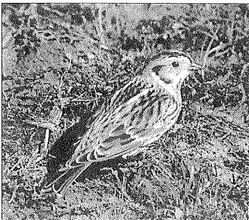
A Lapland Longspur blends with the ground.

So you are walking on an artichoke field in San Mateo County, a plowed field on Point Reyes, or a short-grass prairie in Placer County, and a flock of 100 small landbirds jumps up, blows around for a while, and lands far away. You aim your scopes and focus down, but all that can be seen are larks and pipits. The longspurs (not larkspurs; those are flowers) are crouched out of sight in furrows or behind clods. Blending with dirt is a specialty of the group.